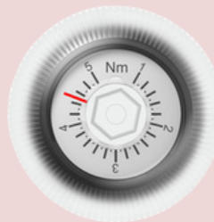
PB 8317 A ESD Torque Range (0.4 Nm ~ 5.0 Nm)