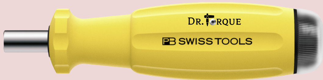
PB 8317 M ESD Torque Range (0.4 Nm ~ 5.0 Nm)